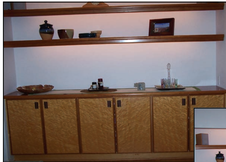
Unmatched quality in custom Birdseye Maple cabinetry