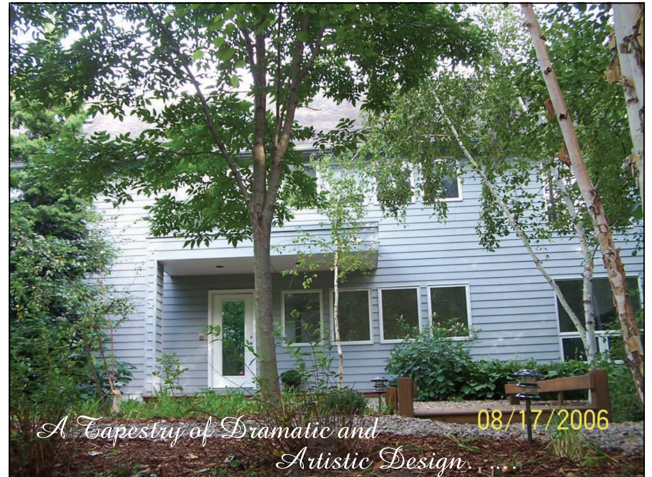
A Tapestry of Dramatic and Artistic Design...

... can be found in this exquisite, private luxury home located in Clarence, New York