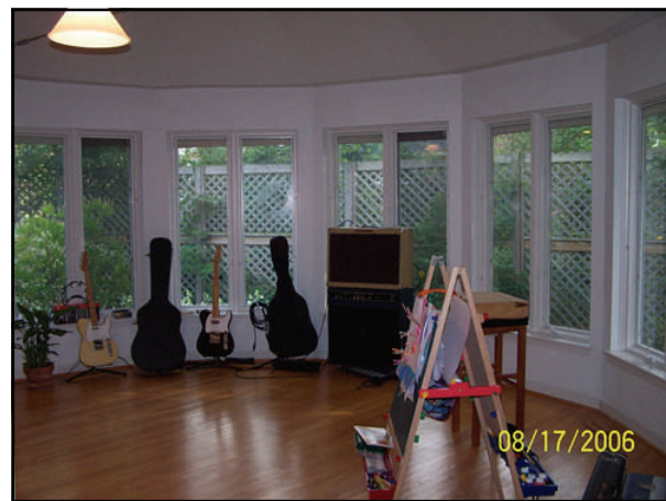
Stunning Sun room with more beautiful windows